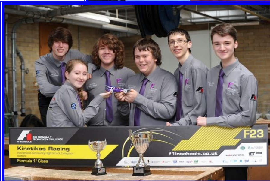
F1 IN SCHOOLS